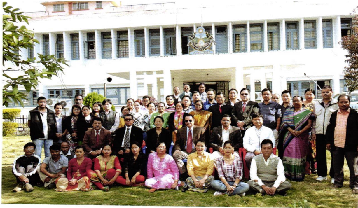
Commission with officers & Staff